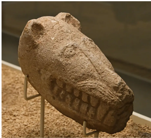
Limestone statue of animal head, Gobekli Tepe