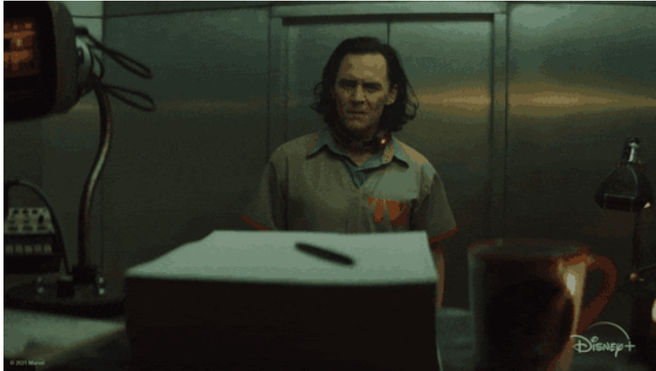
I agree, Loki.

The first time I heard it was during the first so-called “ internet revolution ,” in Serbia . You can look at Serbia now, 20 years later, and see whether all of this has come true. Then it was the beginning of social media, the Arab Spring, Iran. With N.F.T.s, it is basically the same. The only difference is that now we’re hearing it from Paris Hilton .