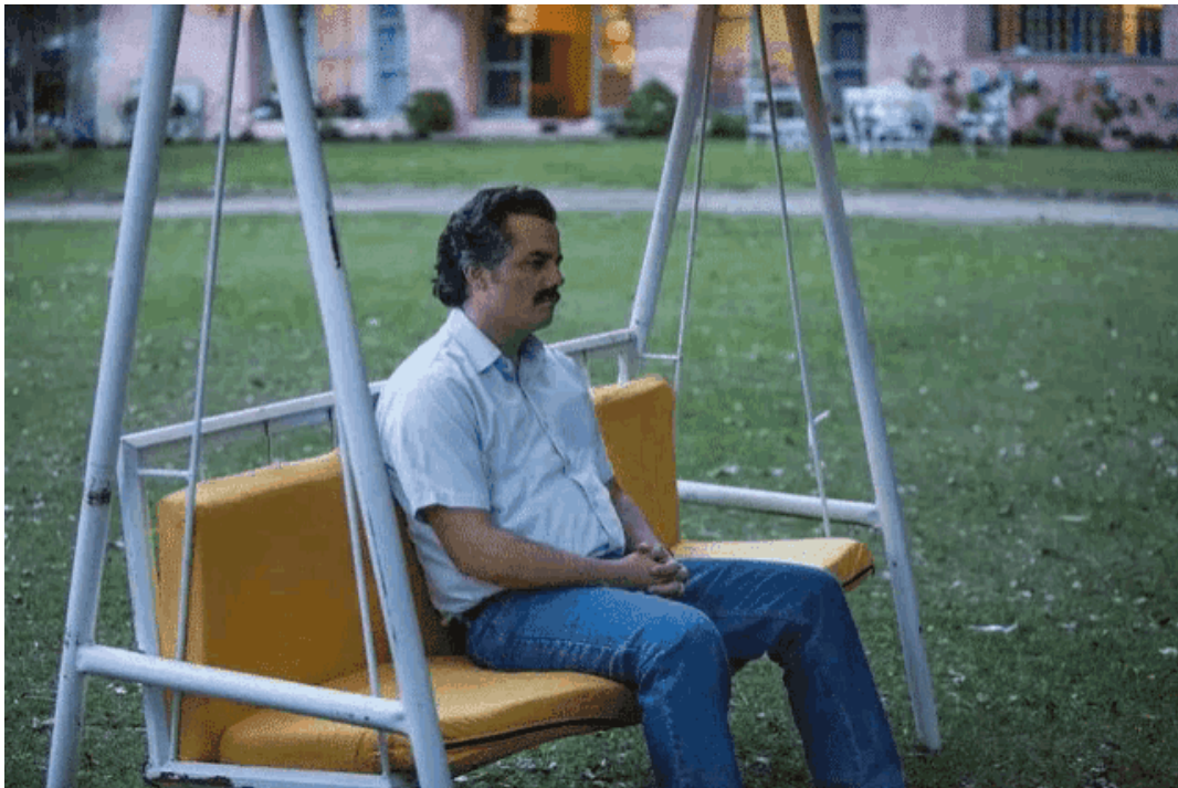
Me waiting for tips and leads.